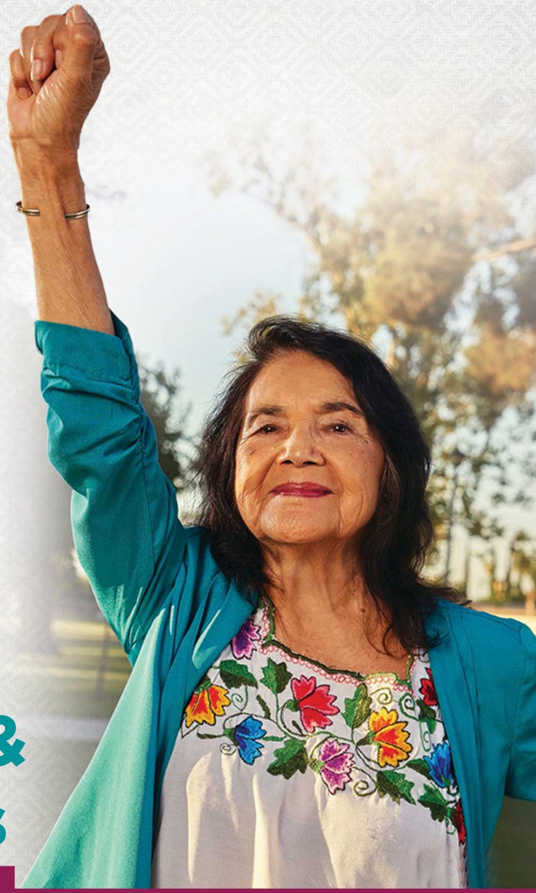
Dolores Huerta. © Glamour Magazine Women of the Year, October 13, 2020. Photo by Nowlen Sifuentes, used with permission

DOLORES HUERTA FOUNDATION FOR COMMUNITY ORGANIZING