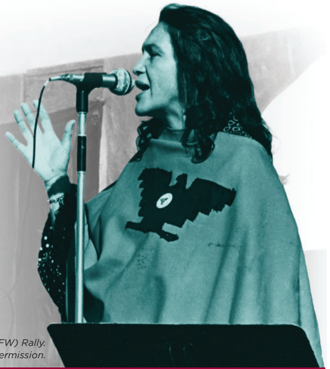
Dolores Huerta Speaks at United Farm Workers (UFW) Rally.

Dolores Huerta is a labor leader and community organizer. She has worked for civil rights and social justice for over 60 years. She attributes her passion for community organizing and building leadership to being an active member of the Girl Scouts from age eight to eighteen years old. Dolores grew up in a richly diverse community, which has shaped her activism for decades.